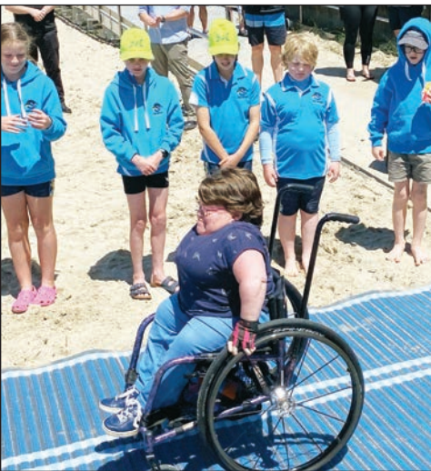
The Disability Inclusion and Access Advisory Committee in Kingborough is looking for new members to advise Kingborough Council on infrastructure around the municipality that can be upgraded to enable greater accessibility. (PS)