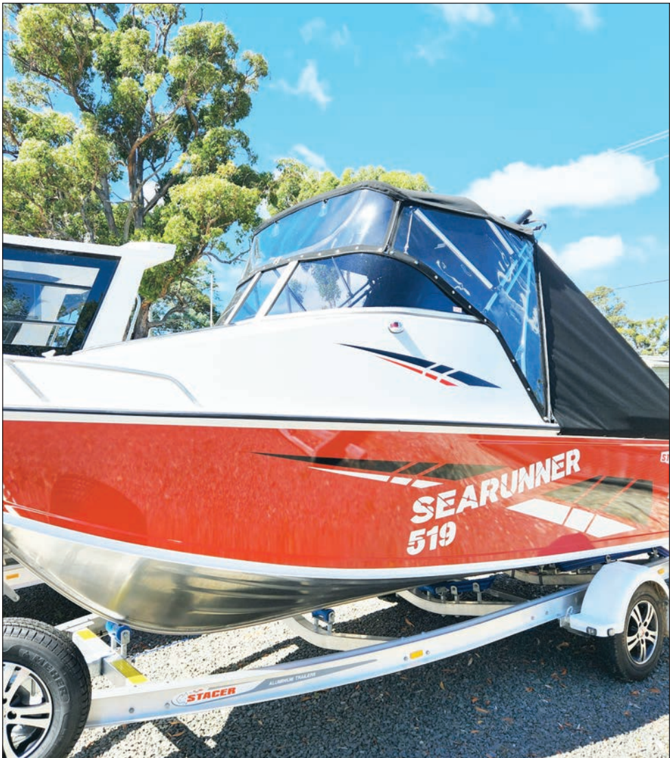
Head on into Channel Marine Margate and let the team help fulfill your next boating dreams. (PS)