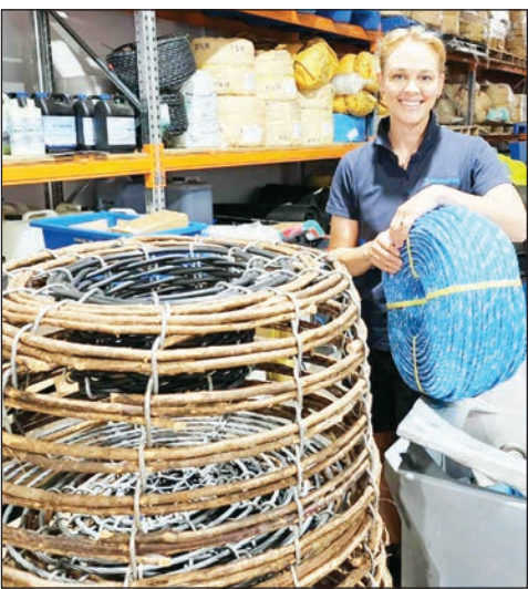
Seamaster has announced a major expansion of its Margate warehouse with extended product offerings and a wider array of high-quality equipment and supplies. Their team of skilled professionals ensures each client gets the most out of their purchases. (PS)