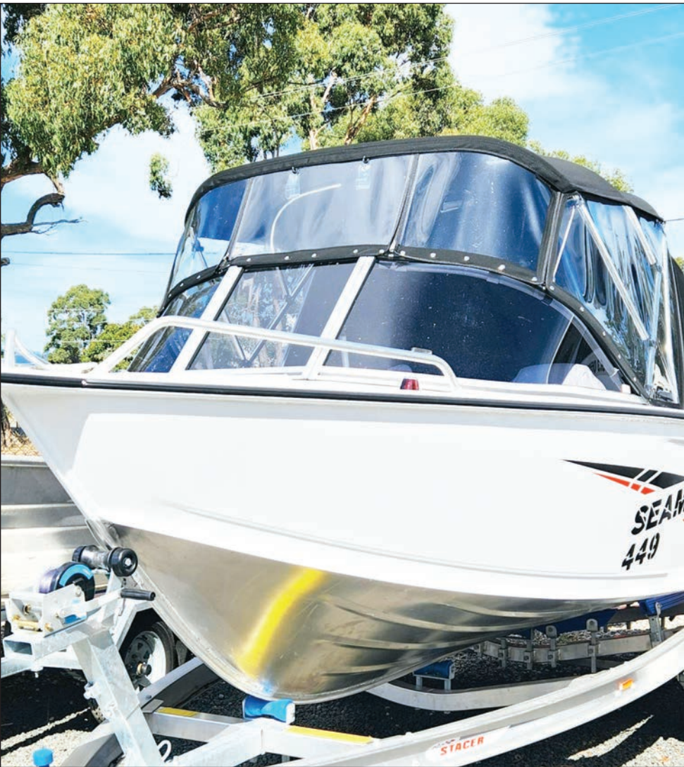
Channel Marine have exciting new stock in time for Easter. Imagine yourself out in one of these beauties over the holidays. (PS)