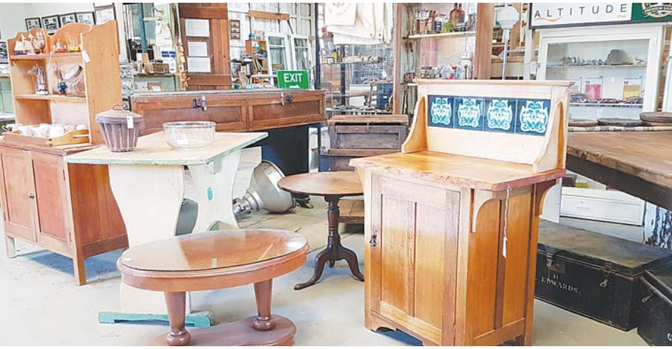
The Red Shed on Wilmot Road, Huonville has a vast array of lovely old bits and pieces.

Come in and check out all the great stock available at the Red Shed or visit their website www.redshed.biz