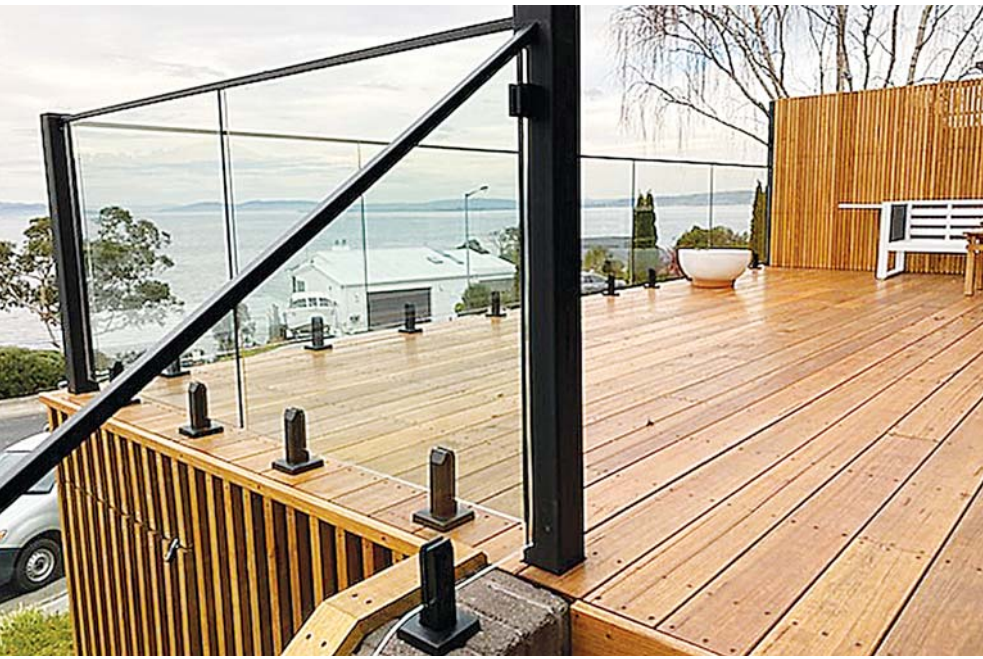
Locally owned, Kingborough Glazing offer quality products and professional advice. (PS)