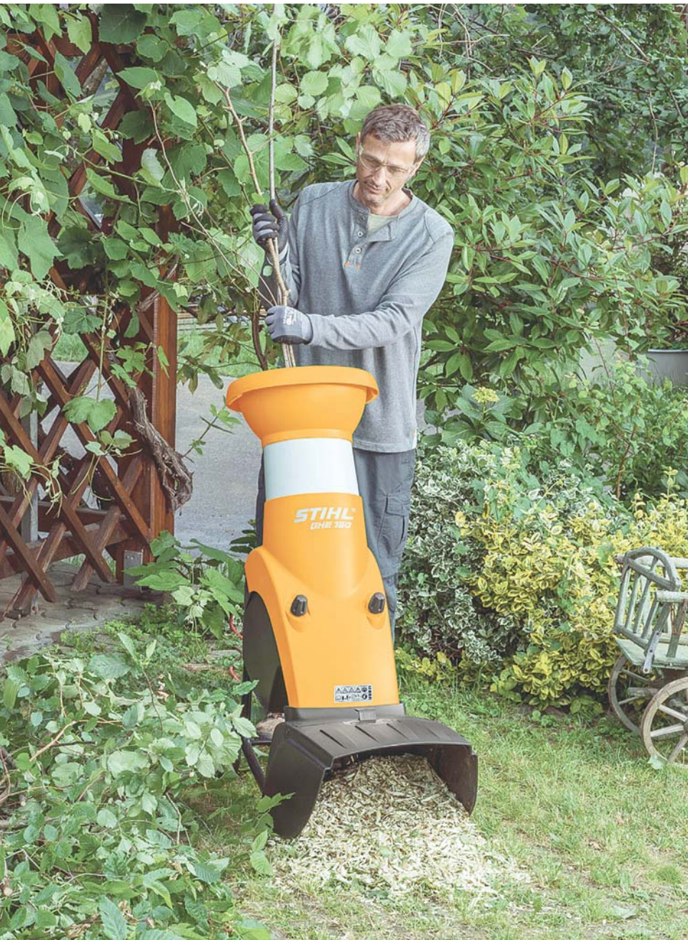
The Stihl garden shredder is only available at your local Stihl specialist. A great tool for tidying up tree and hedge cuttings, leaves and withered flowers. (PS)