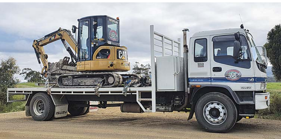
Josh Direen owner of J.D. Excavations, Landscape & Maintenance Pty. Ltd. services all areas, offering excavation services including driveways, drainage, house and shed cuts, footings, pier holes, site clearing and clean up. (PS)

Give Josh a call on 0447 138 718 for all your excavation, fencing, tree lopping and landscaping requirements.