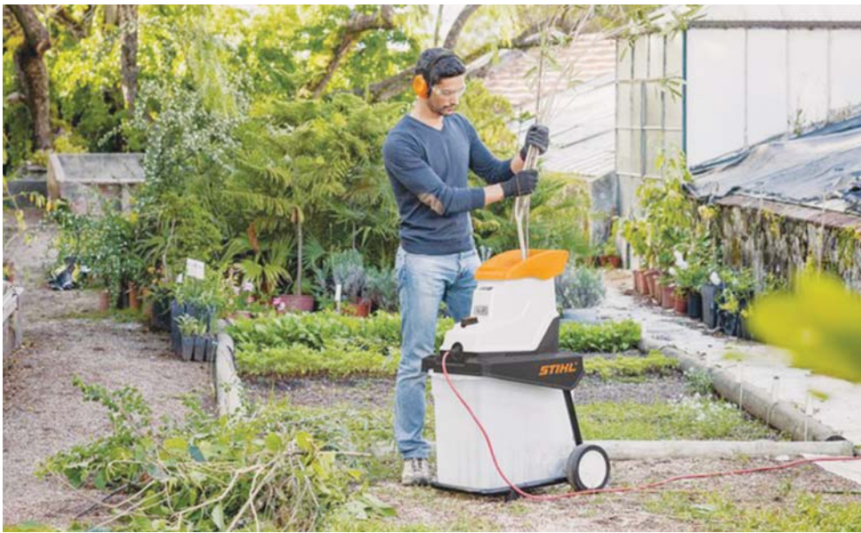
Stihl Shop Huonville, on Wilmot Road, offers top quality garden care tools and machinery. Their knowledgeable staff are always happy to help and give expert advice. (PS)