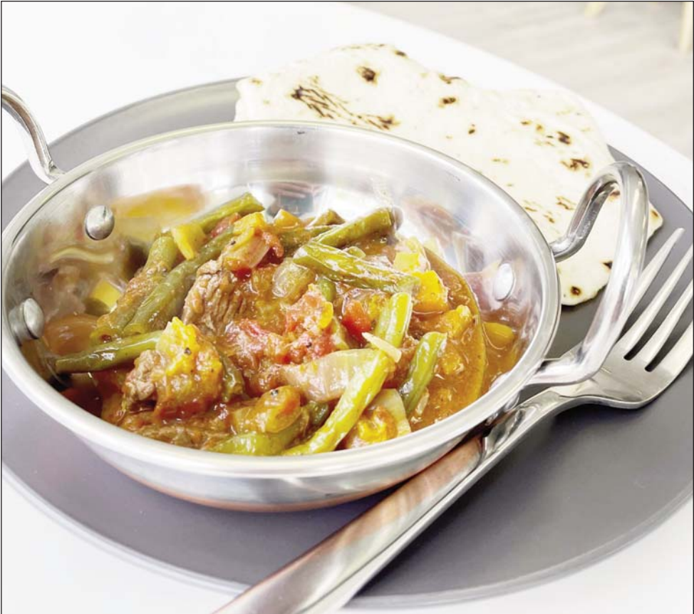
Kingdom Coffee now offers lunch specials which change every Friday! This week's special is an Island Curry dish served with two warm naan for only $12.90! (PS)