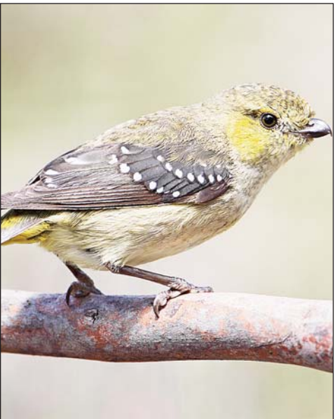
White gums are critical for the survival of the endangered forty-spotted pardalote, as the trees provide their only food source.

Call 6211 8200 or email kc@kingborough.tas.gov.au