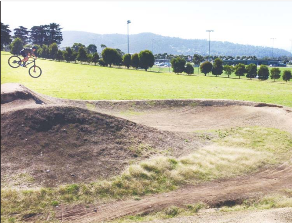
Kingston Mountain Bike Park will be the first public asphalt pump track in southern Tasmania. (PS)