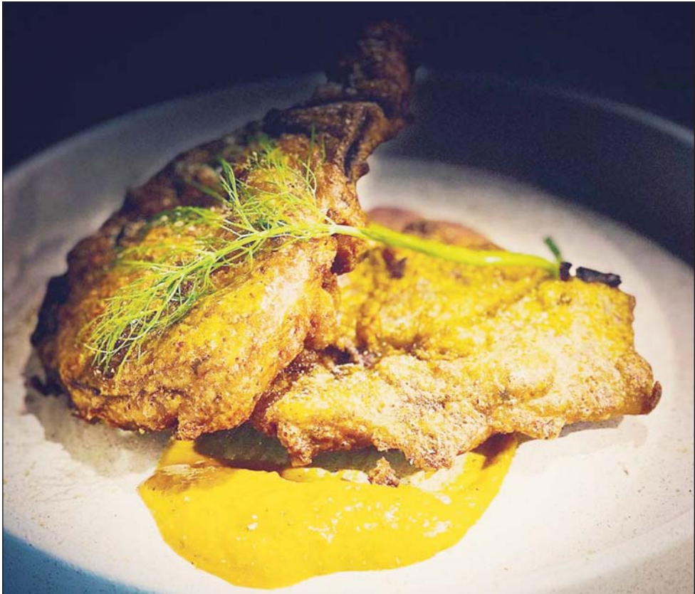
Bombay on the Beach is cooking up tasty Eggplant Pakora. Eggplant sliced and marinated in Indian herbs and spices, coated with chickpea flour and fried to perfection! Homemade dip completes the dish. (PS)