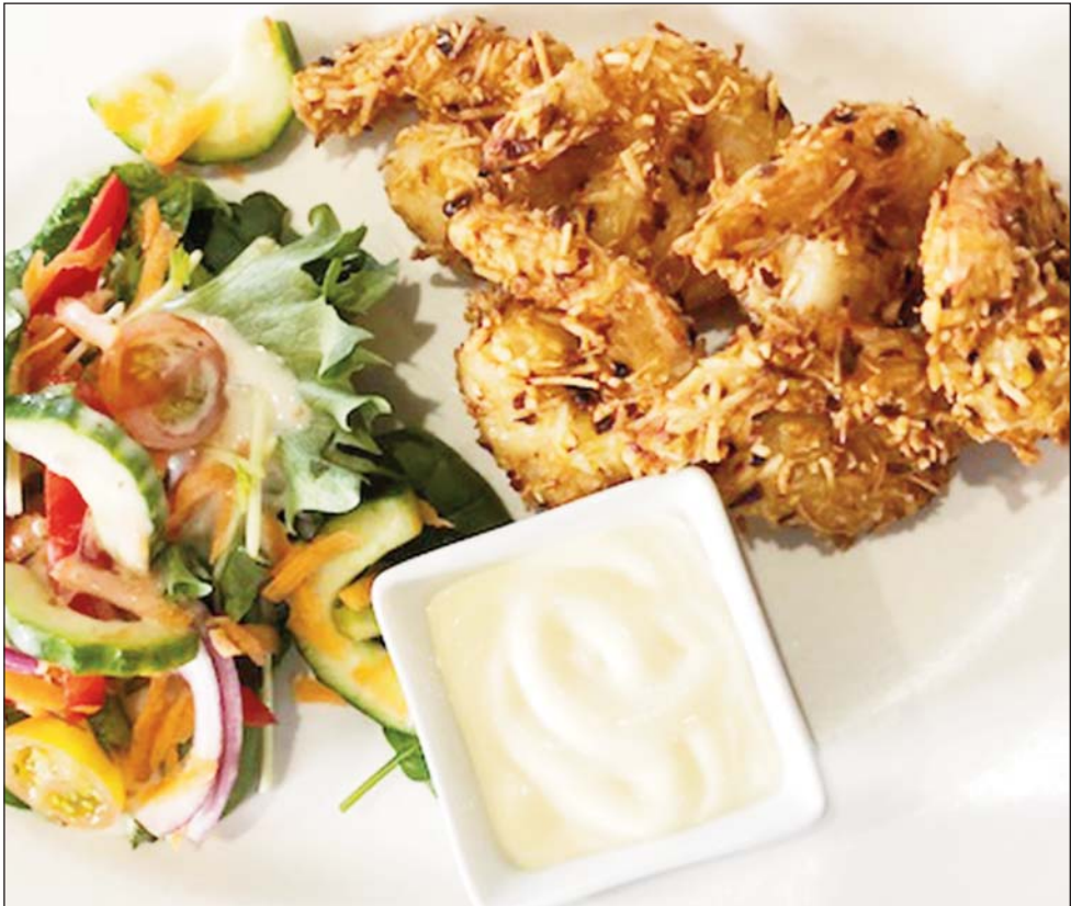
The Grand Hotel, at 2 Main Street in Huonville, is open for lunch and dinner from Monday to Saturday, and lunch only on Sunday. Offering a wide range of entrees, mains, desserts and specials, call 6264 3256 to book a table. Takeaways are available while the kitchen is open. (PS)