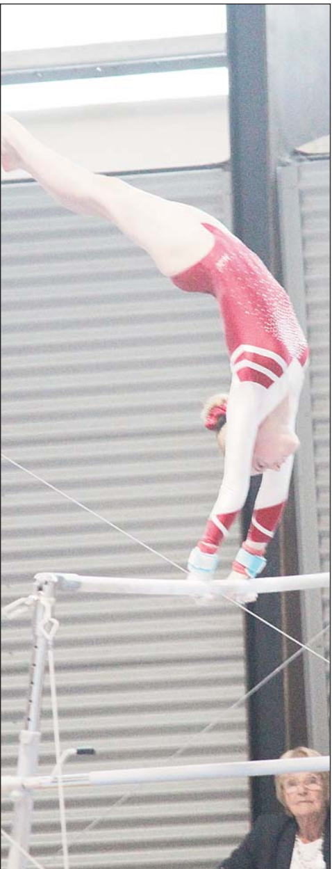
Kingborough Gymsports was represented by 18 gymnasts in the Women's Artistic Gymnastics Senior State Championships over the weekend of March 19 and 20.

To find out more, visit economicplan.gov.au