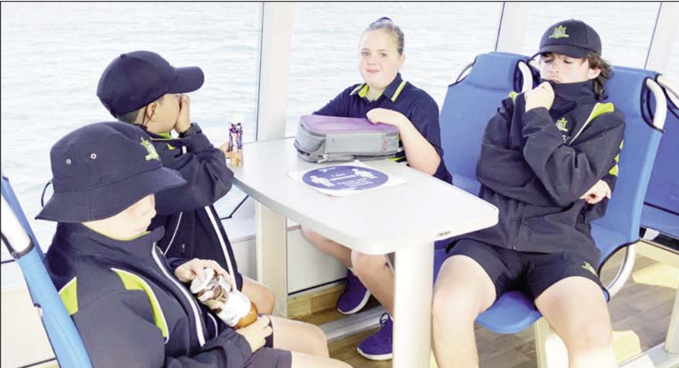
Students from St Aloysius Catholic College enjoyed travelling via ferry to Bruny Island. (PS)

The deed agreement allows Aboriginal people to develop skills in managing and governing abalone in new economic settings for their own cultural benefit.