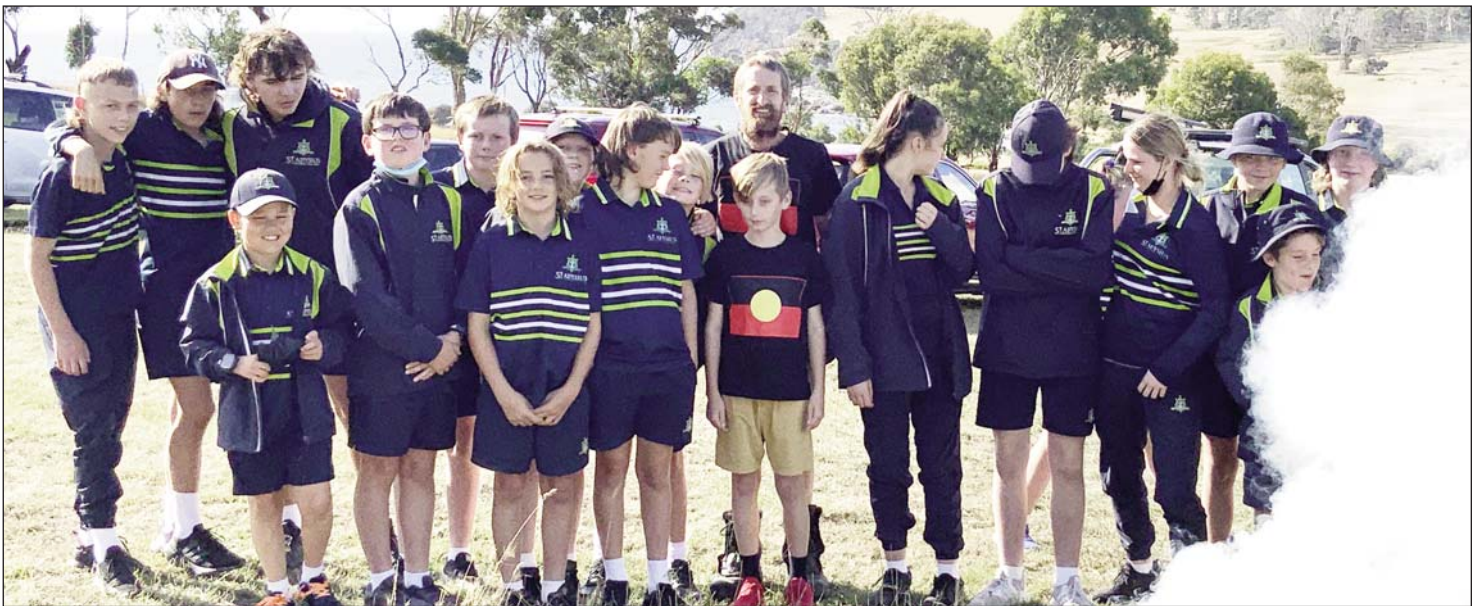
A group of palawa students from St Aloysius Catholic College attended an historic event on Bruny Island on March 17, where 40 abalone quota units of Sea Country resources were returned to Tasmania’s First Nations people. (PS)

The Close the Gap campaign recognizes that health is