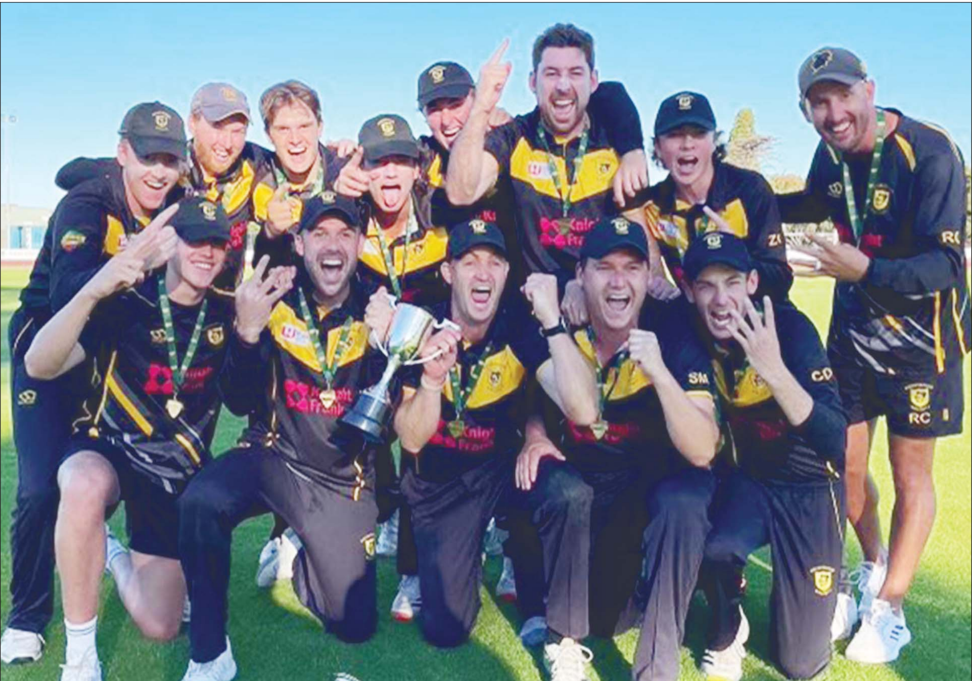
The Kingborough Knights 2nd Grade team came home with a 17-run victory against New Town Bucks in the final game of the Cricket Tasmania Premier League season, on Saturday, March 26, at New Town Oval.