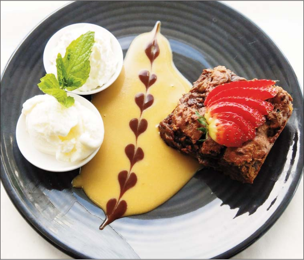
Fancy a tasty dessert after your meal? Eagles by the Bay has desserts covered! Open Wednesday to Saturday, 8am to 3pm, for all day breakfast, with lunch served from 11.30am. Contact the team today to make your next booking! (PS)