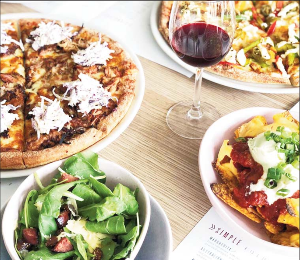
Pep Pizza Kingston Beach bakes fresh pizza and prepares appetising side dishes from locally sourced produce. Don't forget to pre-order online, to avoid wait times, at www.peppizza.com.au (PS)