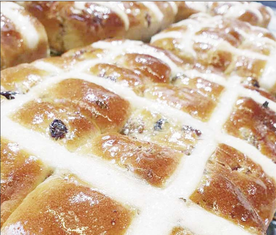
In store at Breadd from Saturday, April 2, grab freshly baked Easter Brioche for the upcoming holiday. Brioche is made with eggs, milk and butter, unlike bread, resulting in a light and lush bun. They're a special treat. Enjoy your Easter! (PS)