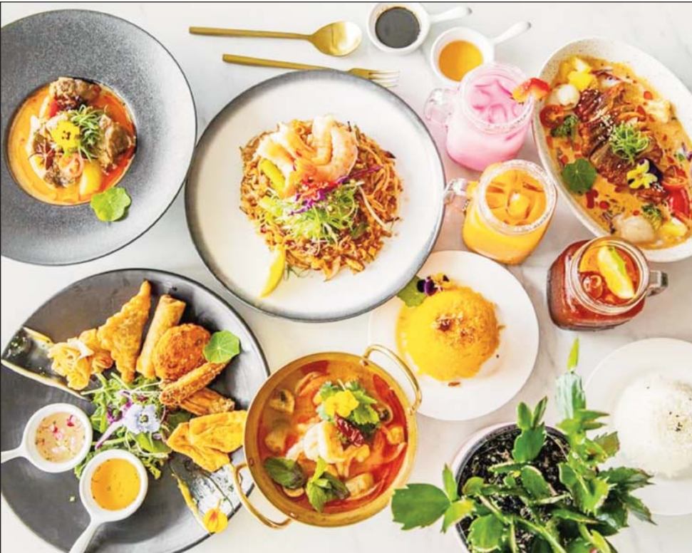
Kwanjai Thai proudly serves an authentic twist on modern Thai foods, carefully adjusted to your taste. Each dish is created from freshly sourced ingredients and the team takes great pride in food presentation, resulting in a taste sensation and great look! Food unites us and sitting down to share a meal is one of the simplest ways. Share meals with friends and family at Kwanjai Thai with their banquet menu. (PS)