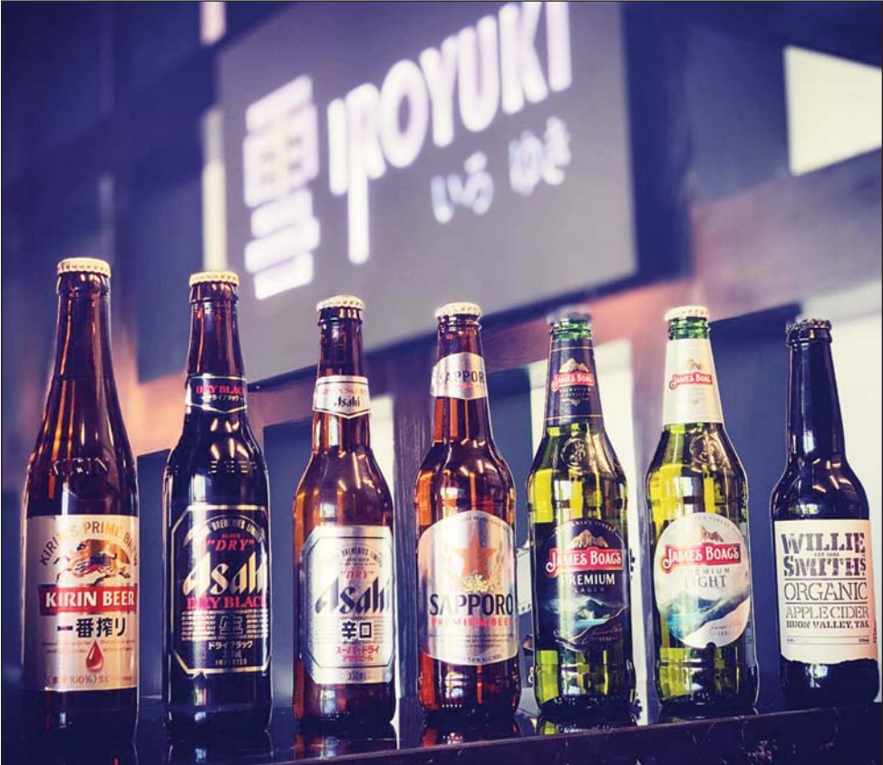
For an authentic Japanese experience, Iroyuki Ramen Bar has an assortment of Japanese beers and sake to accompany your meal. (PS)