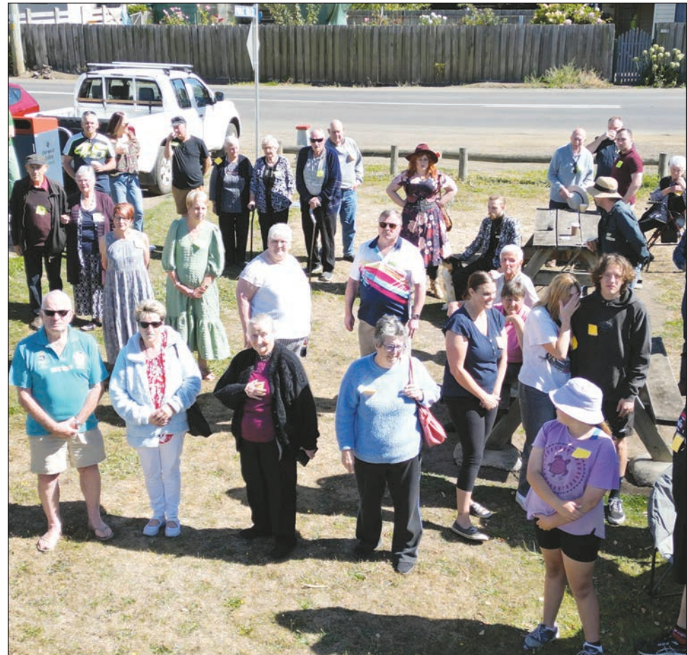
Approximately 70 people attended the March reunion of the Browning, Hanlon, Ransley and associated families at Westerway Hall.

Photos were taken throughout the day to keep a visual record of a successful event.