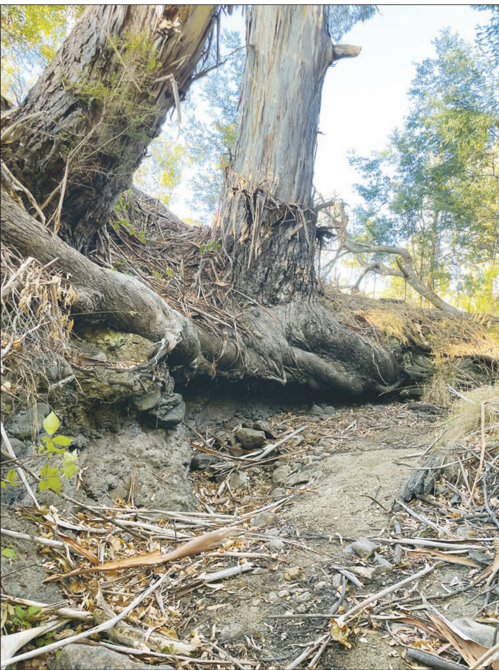
The Tramway Hill Landcare Group reports that Nierinna Creek was completely dry in March when members went to weed the reserve. This bend in Nierinna Creek is towards the eastern side of the reserve and usually the deepest stretch.