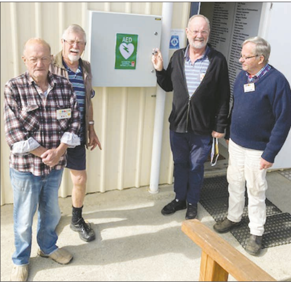
Channel Men's Shed recently upgraded their defibrillator. It is now located on the outside of the building adjacent to the entry in an unlocked cabinet, making it to available to other community organisations and the public. (PS)