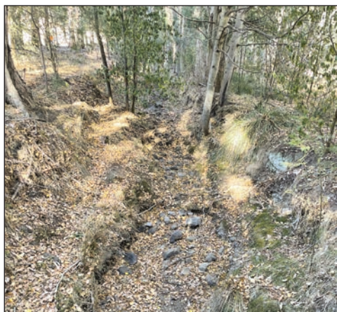
Volunteers could find no sign of water in the creek.

The group has plans to weed Nierinna Creek Reserve, Davis Flat, Brinks Link and Tramway Hill during their next working bees.