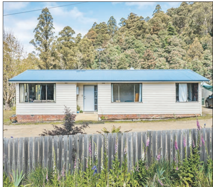
3 1 5