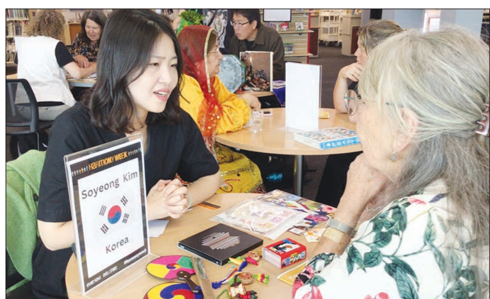
The ages of participants varied widely. (PS)