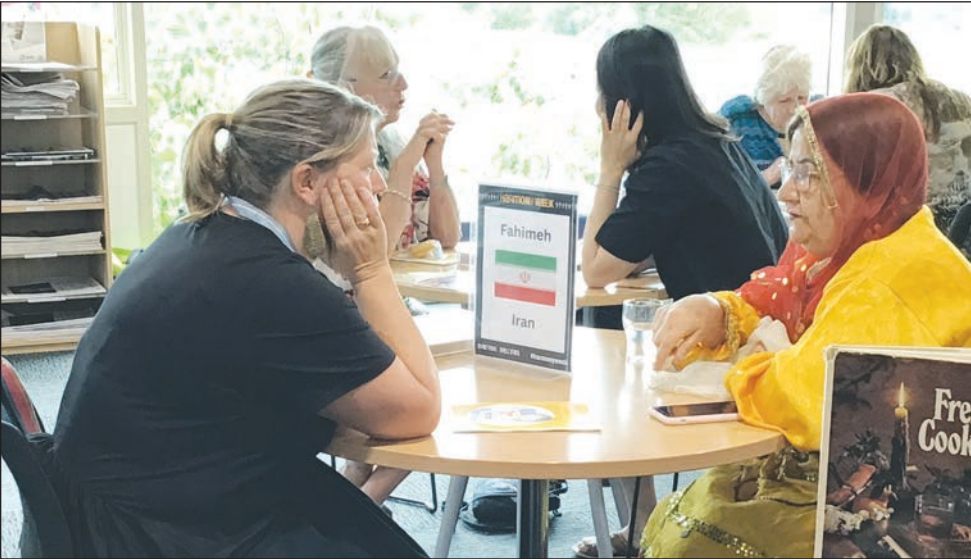
During Harmony Week at the end of March, Kingston Library hosted a Cultural Quick Connect event. Participants from different cultural and linguistic backgrounds spent short sessions together learning about language, culture and the lives of their fellow participants.

Through these stories, children learned about how we express emotions in different languages.