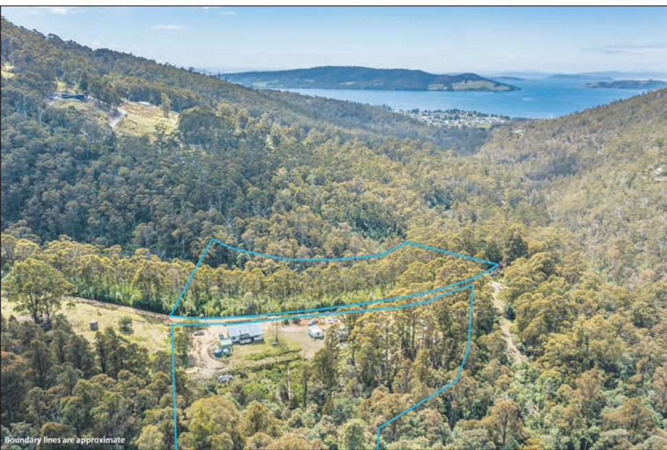
Boundary lines are approximate