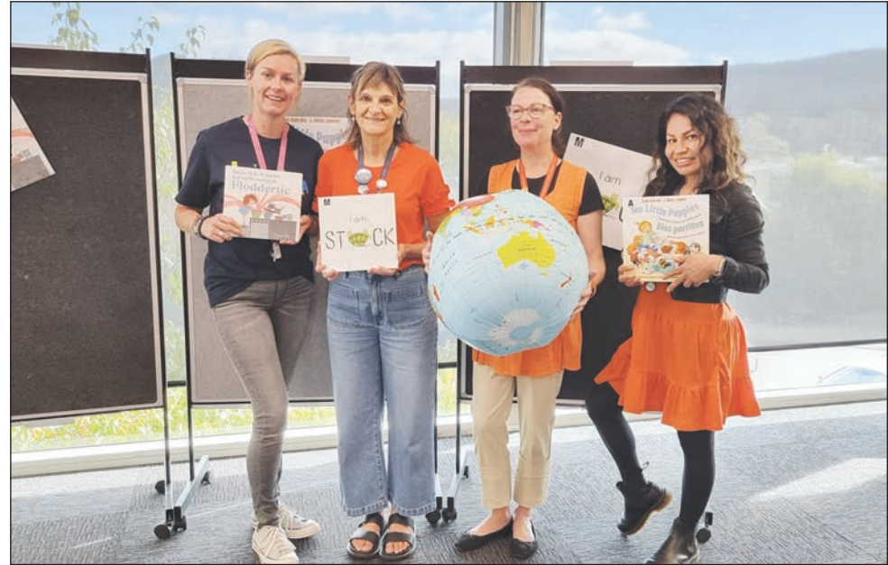
Library staff said that the event was designed to bring people from diverse backgrounds together. (PS)