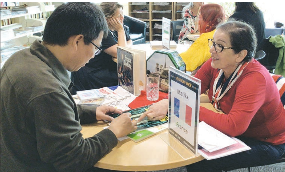
Participants in Quick Connect came from places as far apart as Japan, Iran, Italy, Peru and the Netherlands. (PS)