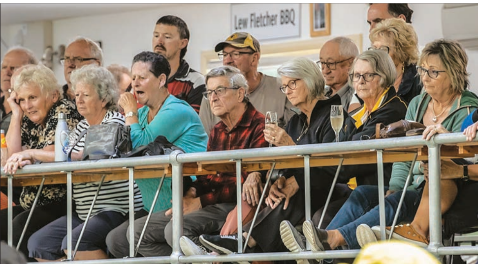
Spectators flocked to witness a close preliminary final between Kingborough's Division 1 ladies and Glenorchy Rodman. The Tigers ultimately won with 10 points, 60-54.

The Division 1 ladies played against reigning premiers Howrah in the grand final on Tuesday, March 26.