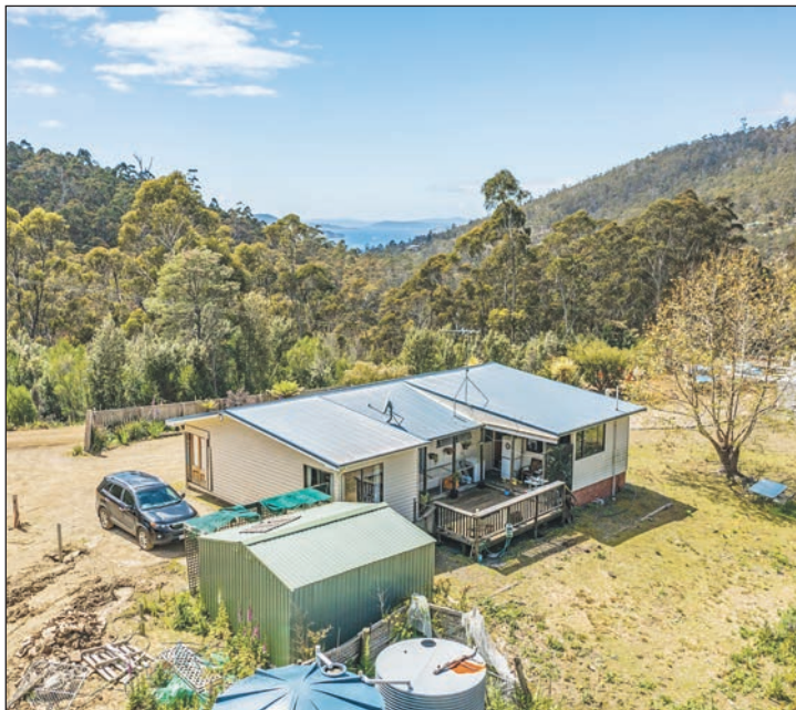
SNUG 307 Snug Tiers Road