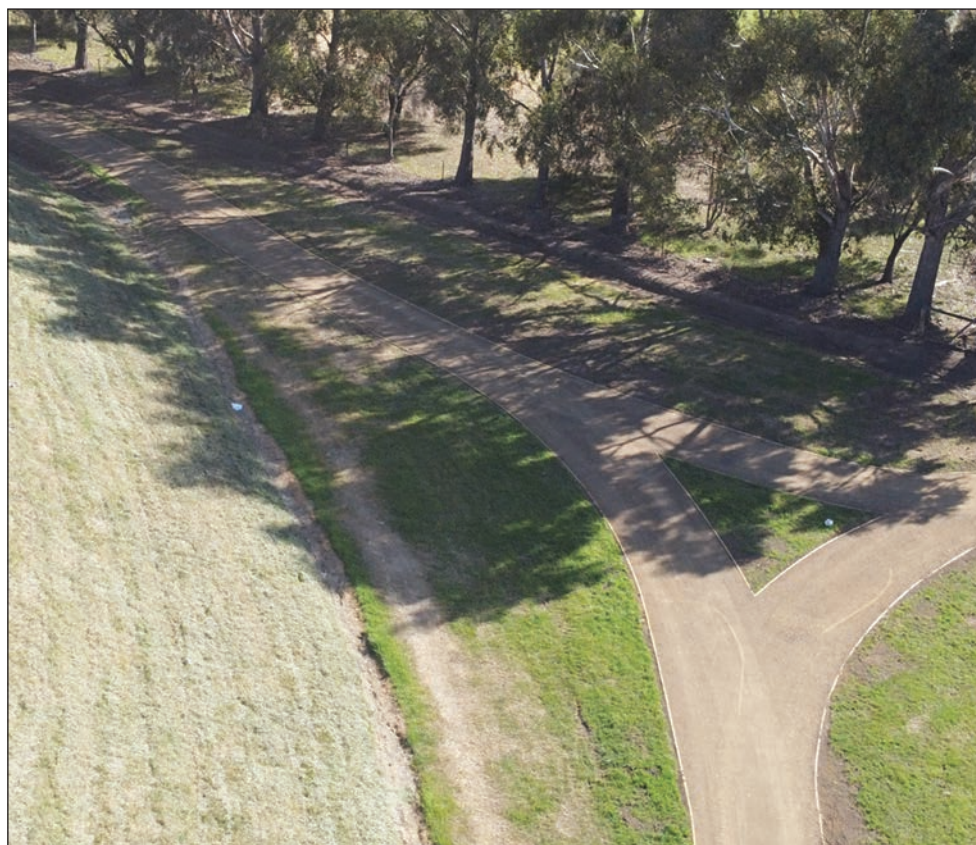
Sections of pathways have been built to connect the Sports Precinct to O'Connor and Corlacus Drives. These pathways will link to Whitewater Creek Track at a later stage with further works scheduled to build a bridge and connecting pathway. (PS)