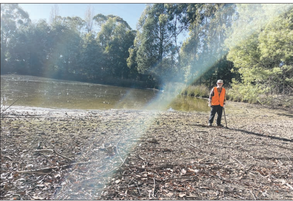
Volunteer Dave Reynolds investigated the lower water levels on the western side of the dam. Volunteer Roz Thurn said this was the lowest water level the group had ever noticed in the dam. (PS)