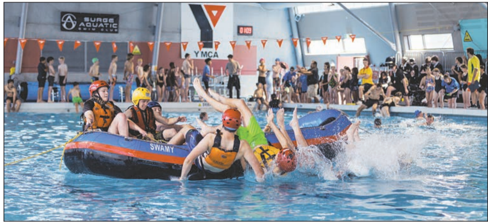
Calvin Christian School held their swimming carnival at Clarence Aquatic Centre recently.