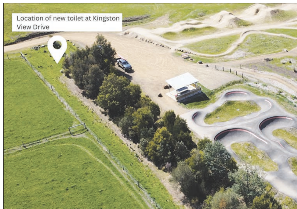
Work on the new Kingston Mountain Bike Park toilet facility on Kingston View Drive has commenced and is expected to finish in the next couple of months. This is a single-occupant toilet and parent room, located next to the mountain bike carpark. (PS)