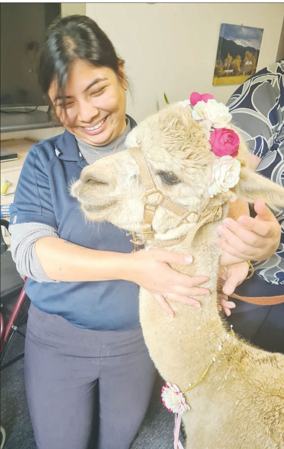
Rosie the alpaca visited Hawthorn Village in Blackmans Bay recently. (PS)

On April 10, Hawthorn Village in Blackmans Bay had a visit from Rosie the alpaca.