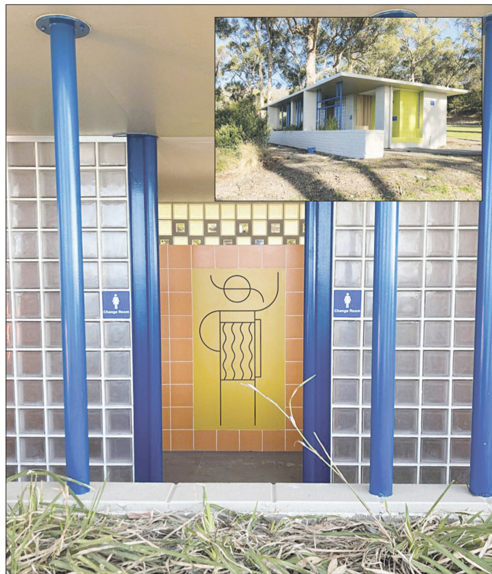
Taroon Beach Public toilets have been refurbished and are open for public use. (PS)