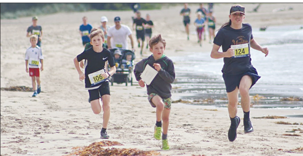
The Raine and Horne Kingston Beach Fun Run and Walk, starting at the Little Athletics Centre on Gormley Road and finishing on Kingston Beach, will be held on Sunday, May 19.