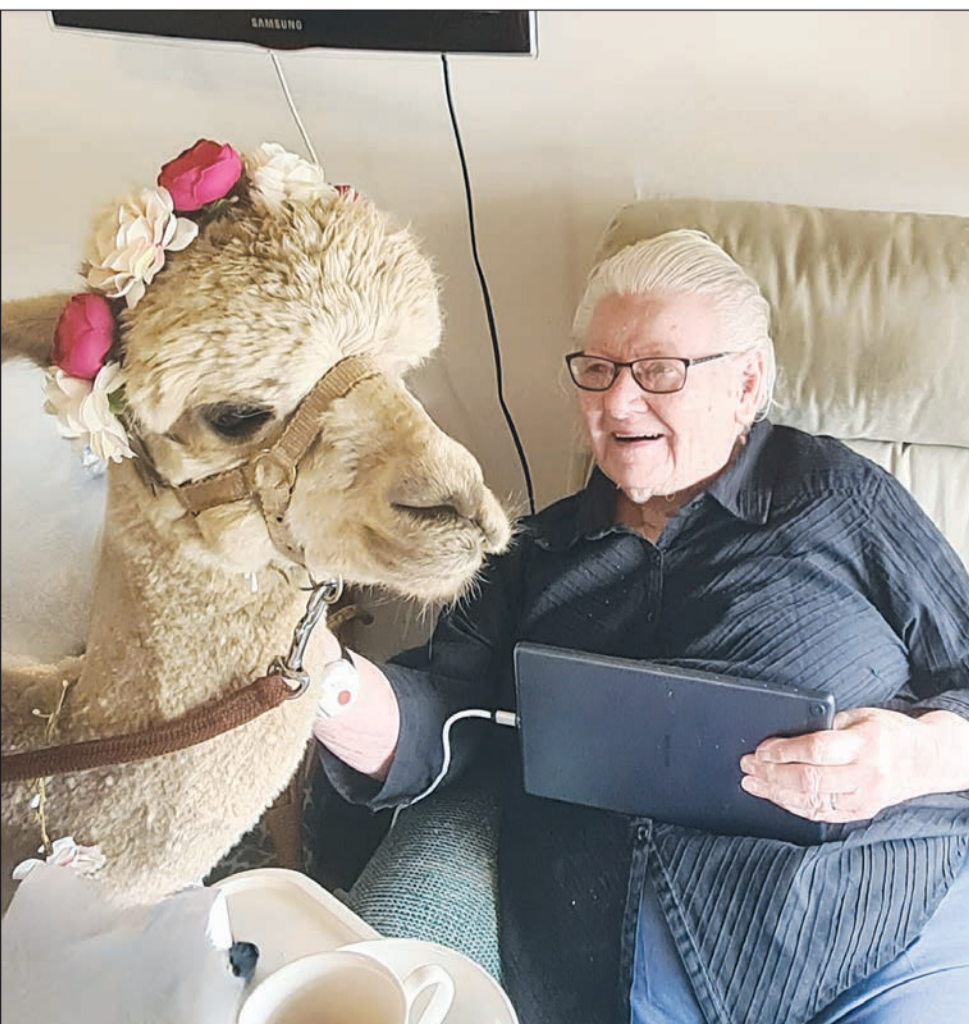
Interacting with animals can provide significant benefits to the health and well-being of care home residents. (PS)