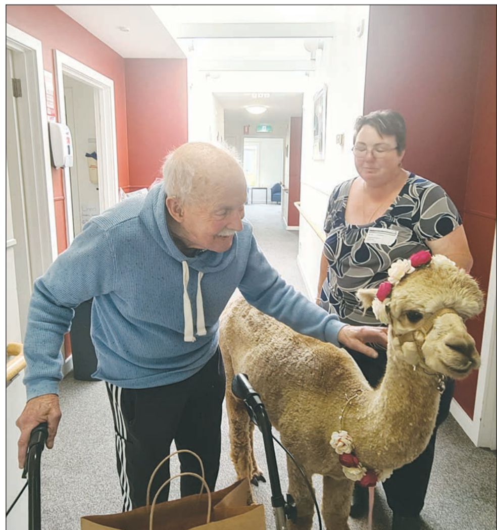
Rosie's visits can help support residents with dementia to express themselves. (PS)