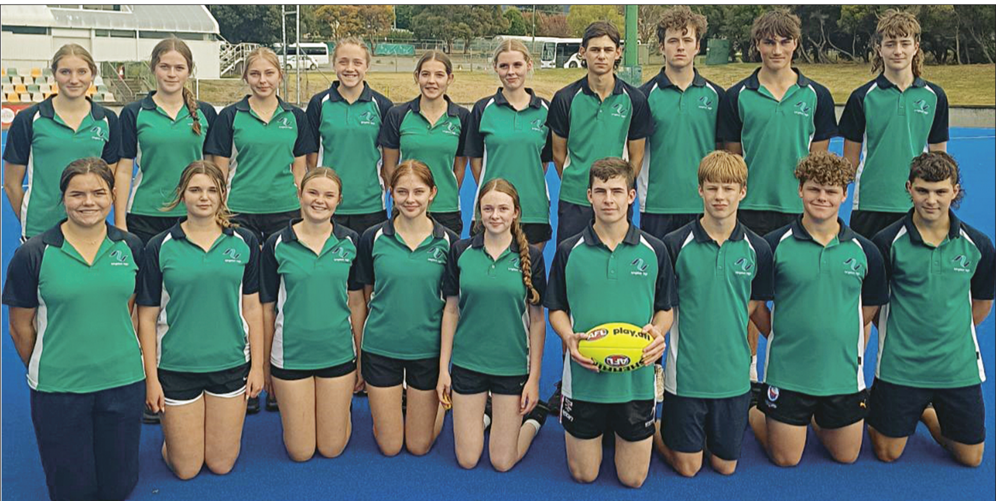
The two Kingston High School teams won their grand finals against Hobart City High School in the Reclink Tasmania AFL 9s recently.