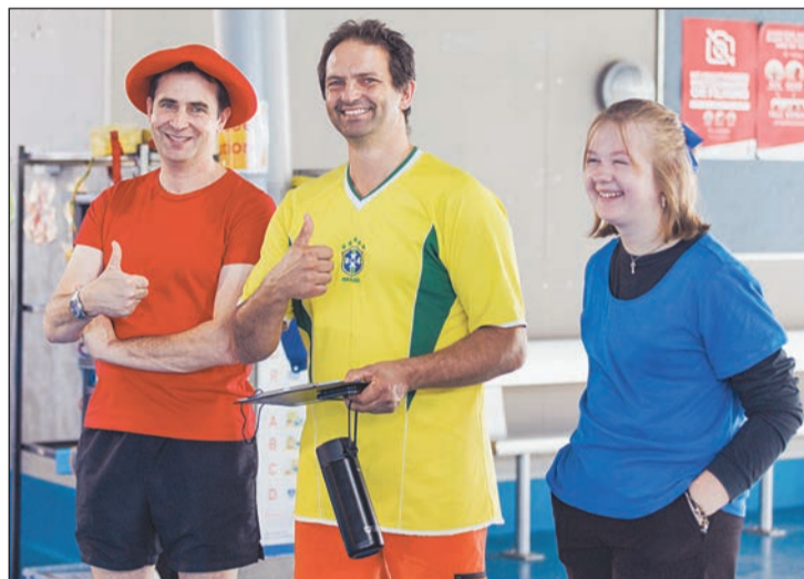
The students are sorted into three houses to compete: Geneva, Westminster and Wittenberg. Geneva won the carnival for the fourth year in a row but only by three points, with Westminster making them work hard for the win.