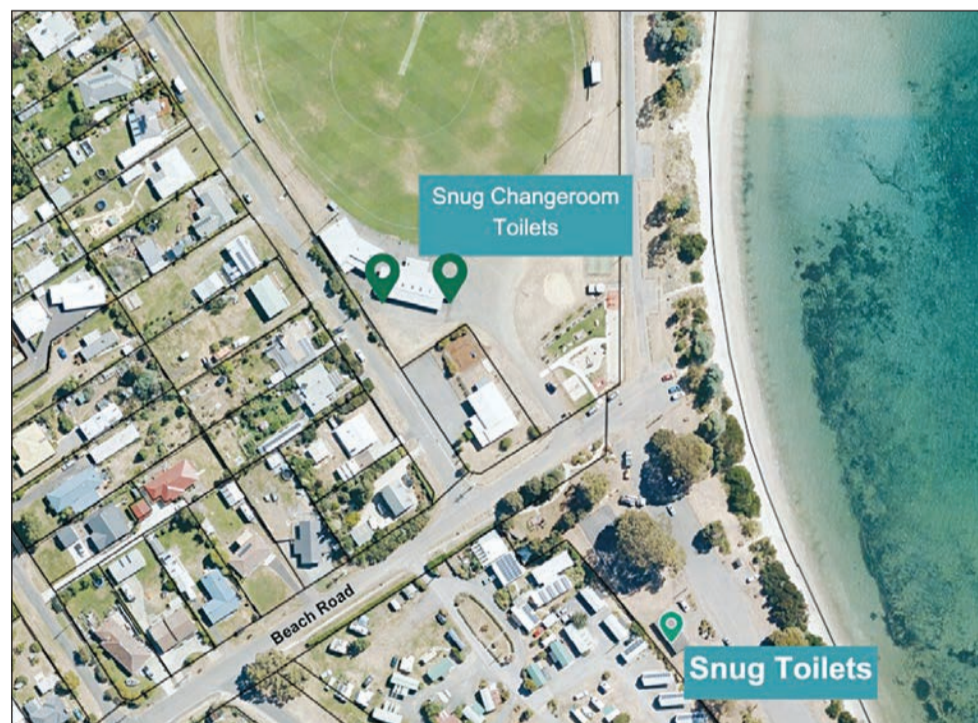
Work on the Snug Foreshore toilets has commenced and is expected to be completed within the next couple of months. Until construction is complete, a portaloo is available along with the toilets behind the Snug Oval change rooms. (PS)

Across - 1, Off one's own bat. 8, Charm. 9, Glisten (anag). 10, Passes. 11, Strike. 12, Fresh. 14, Slugs. 18, Al-pin-e. 20, Porter. 23, Tri-gg-er. 24, Inane (anag.). 25, Lady of the lake. Down - 1, Occupy. 2, Fears (anag.). 3, Numbers. 4, Sage. 5, Whist. 6, Butting. 7, Tender. 13, Rep-ried. 15, Leonine. 16, Pa's-tel. 17, Freeze. 19, Negro (anag.). 21, Tiara. 22, Fret (-work).