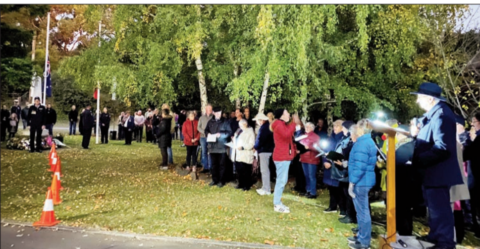
The Woodbridge ANZAC Day Dawn Service will be held at the Cenotaph on Thursday, April 25 and a breakfast will be offered in the school hall afterwards.